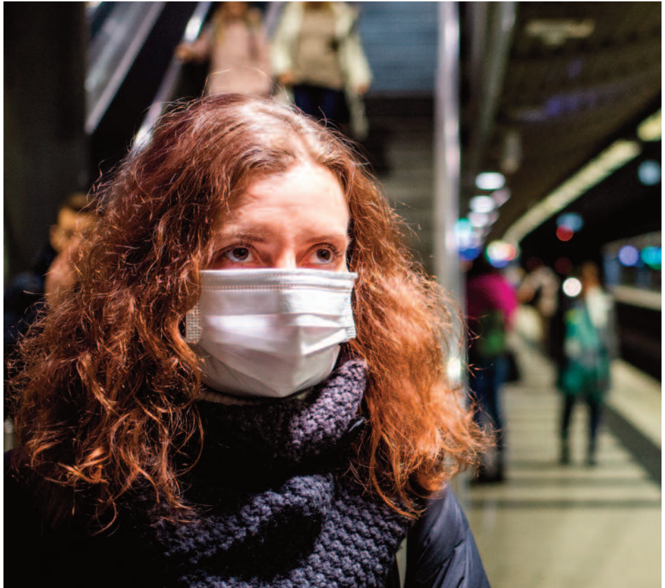
All the further education sector unions have said that social distancing plans must cover travelling to and from work in addition to time spent in the classroom

IT IS crucial that there is no return to further/adult/prison education until it is safe to do so and that we stand together to protect lives. Further education sector unions (UCU, GMB, Unison, Unite and NEU) demand stringent hygiene measures, protection for vulnerable people and isolation for all suspected cases to avoid colleges becoming Covid-19 hotspots.